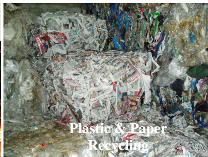
Plastic & Paper Recycling