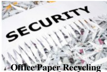
Office Paper Recycling

We at TaG understand the systems and processes your Company has in place for dealing with waste and recycling.